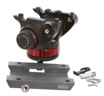
4. Shown in this photo, is everything that should have been removed in steps 2 and 3.

3. With the 4 screws removed, gently lift the original Manfrotto bridge and remove as shown in Photo 3 A. After the original bridge is removed, now remove the locking pivot and push button locking tab as shown in Photo 3B. Please note, please keep the original fluid head lock knob and fluid drag knob in the locked position.