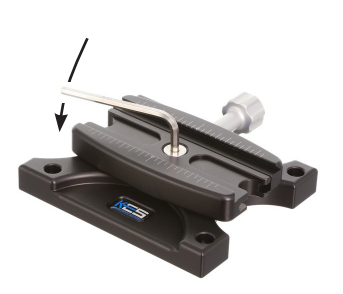
1. Take enclosed <sup>5</sup>/<sub>32</sub> hex wrench (C) and remove the quick release from bridge platform.