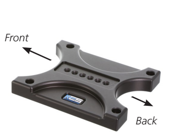
5. Take the replacement bridge and locate front and back as marked on the replacement bridge.